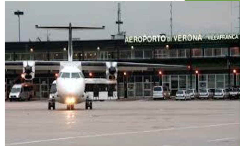
Valerio Catullo Verona