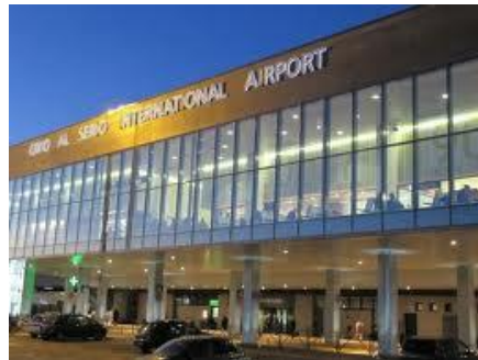
Aeroporto Orio al Serio Bergamo