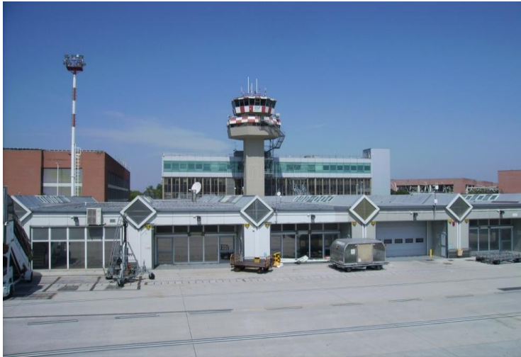
Marco Polo Venice

There are two international airports ( aeroporto ) near Vicenza: