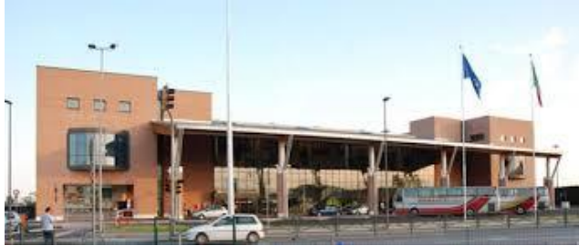
Aeroporto Sant'Angelo Treviso