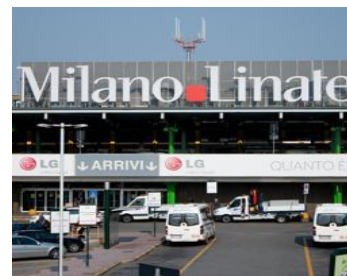
Aeroporto Linate Milano