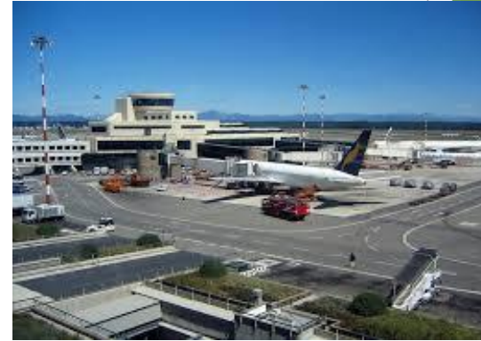
Aeroporto Malpensa Milano